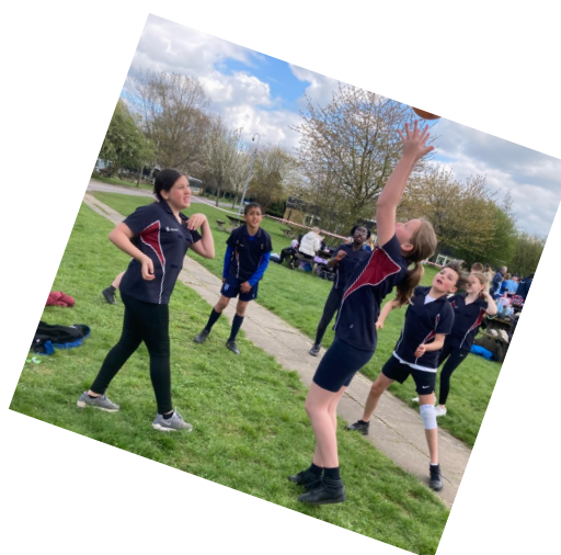
MYG Netball Team