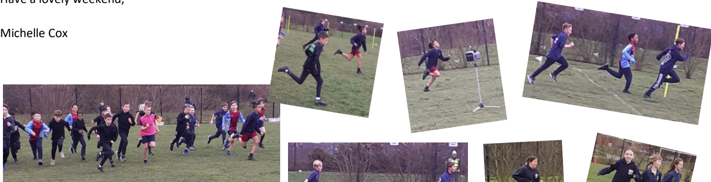
Cross Country at St Mary's Island