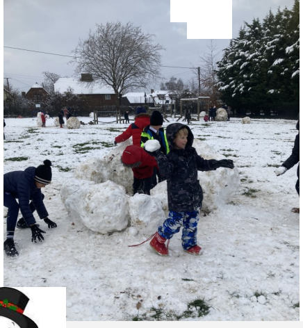
Let it snow! let it snow! Let t snow!!! Fun was had by all!!!