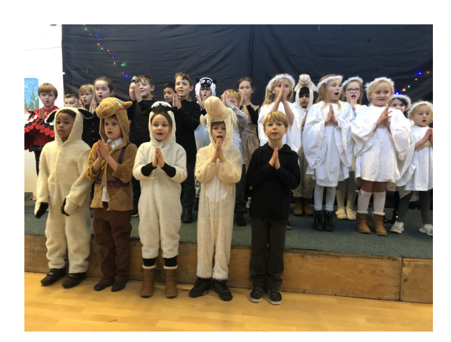
Key Stage 2 Nativity