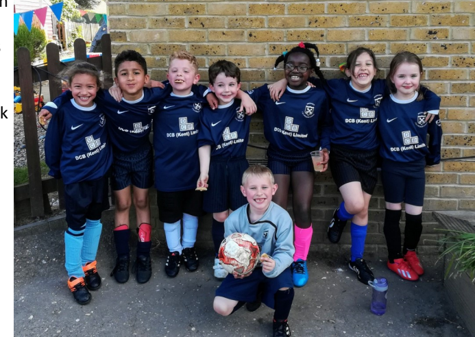
KS1 Football Team L-R